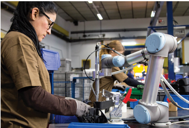
Collaborative robots work safely next to people.